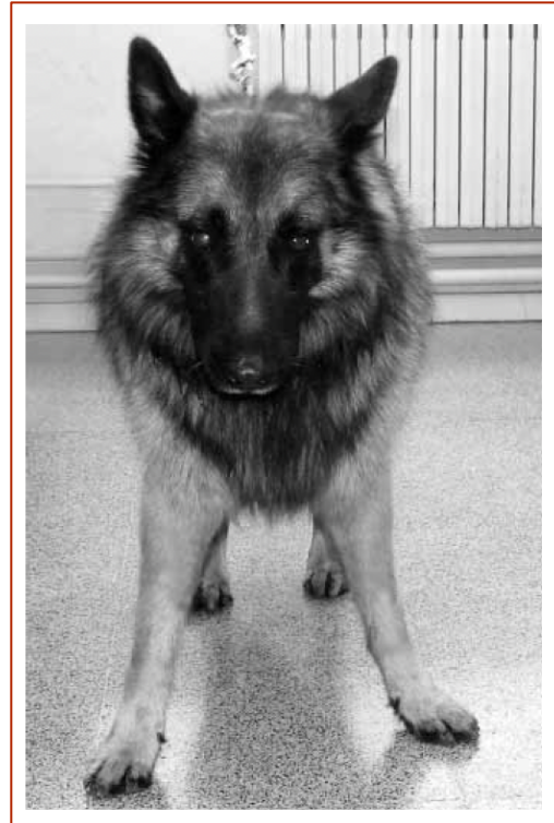
Fig. 1 Front view of the patient with bilateral adduction and external rotation of both forelimbs.

Dogs that received a full infraspinatus transection were clinically normal within 2.5 or up to 10 months following surgery. One dog that received a partial transection (7/8<sup>th</sup> of the tendon was cut) continue to have circumduction at a trot. All of the working dogs and the one racing dog returned to work / training.