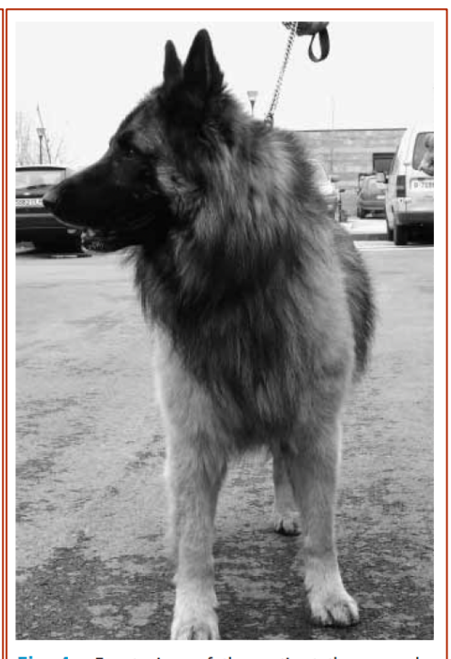
Fig. 4 Front view of the patient three weeks after the second surgery showing resolution of postural abnormalities shown in Fig. 1.