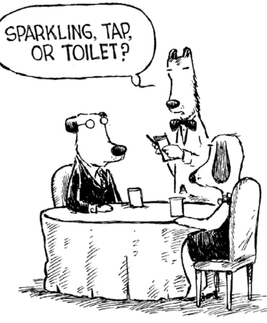
SREEDELINE & BarkBox

"It'll take us forever to fill that thing up again ... "