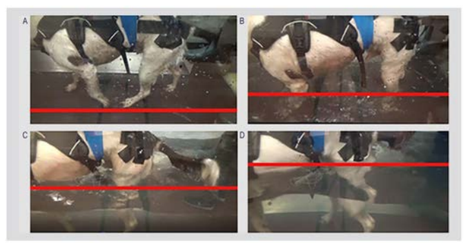
Figure 2. Water depths used during study. (A) no submersion (depth 1), (B) mid-tarsal (depth 2), (C) between the lateral malleolus and lateral epicondyle (depth 3) and (D) between the lateral epicondyle and greater trochanter (depth 4). Line represents the water level.

Well, exactly as the discussion points out: If in the early stages of rehab, higher water depths are likely appropriate; If in later stages of rehab, then reduce the water level (or get the dog out of the darn water treadmill and move onto land exercises!